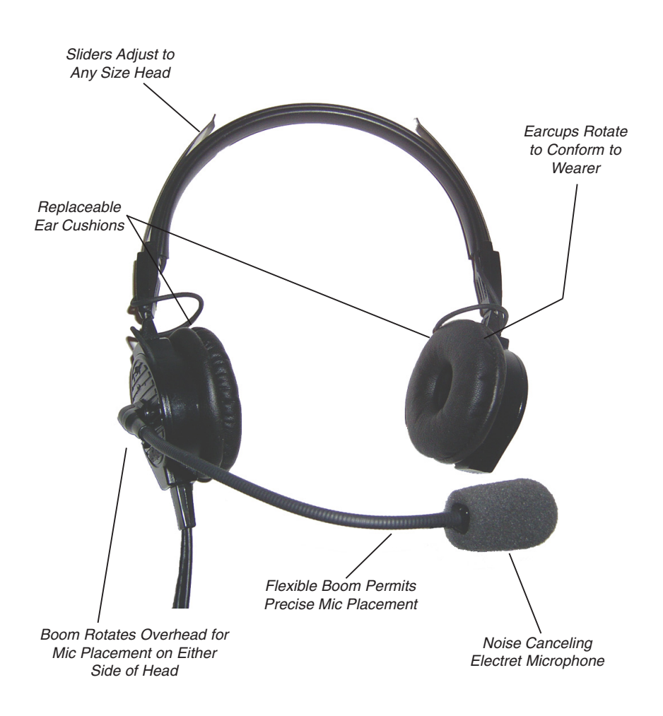
Figure 1 Airman 850 Reference View (Dual-Sided Model Shown)

Note: See Page 8 for Available Replacement Parts