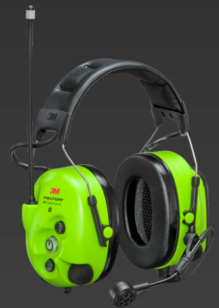
3M™ PELTOR™ WS™ LiteCom Pro III Headset, MT73H7A4D10 Wireless tug-to-plane (with wingwalkers)