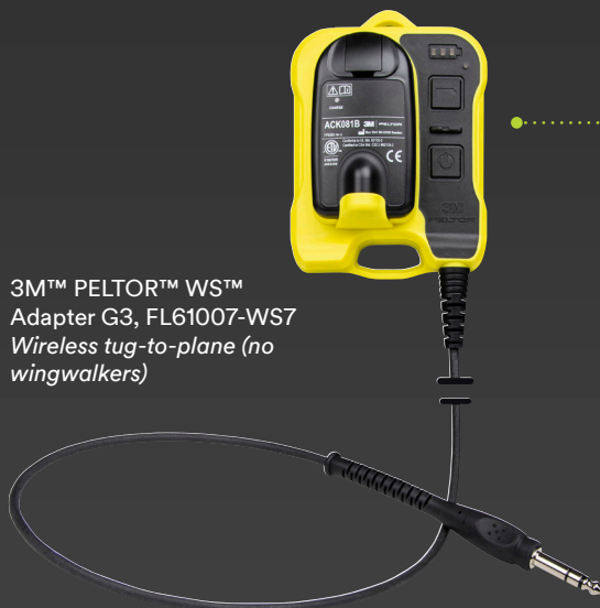
3M™ PELTOR™ WS™ Adapter G3, FL61007-WS7 Wireless tug-to-plane (no wingwalkers)

Introducing the 3M™ PELTOR™ WS™ Adapter G3, Ground Mechanic - the ultimate solution for ramp communication during aircraft pushback operations. With our Bluetooth® technology expertise, we bring you a safe and reliable wireless connection that revolutionizes ground crew communication.